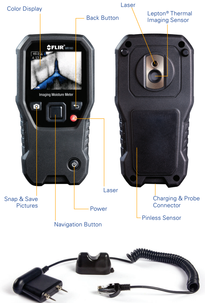
MR02 Pin Probe included

PORTLAND Corporate Headquarters FLIR Systems, Inc. 27700 SW Parkway Ave. Wilsonville, OR 97070 USA PH: +1 503.498.3547